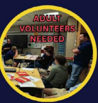
Forms can be found in the Gather Space, in the Church and Faith Formation Offices, or online at www.alphonsus.org.